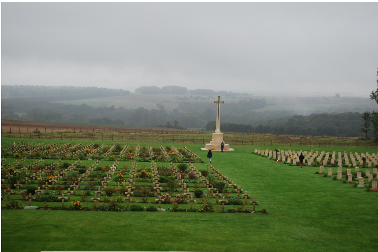
Views from Thiepval Memorial

One Sunday evening there was a comparison between a WW1 soldier's kit and a present day soldier's kit.