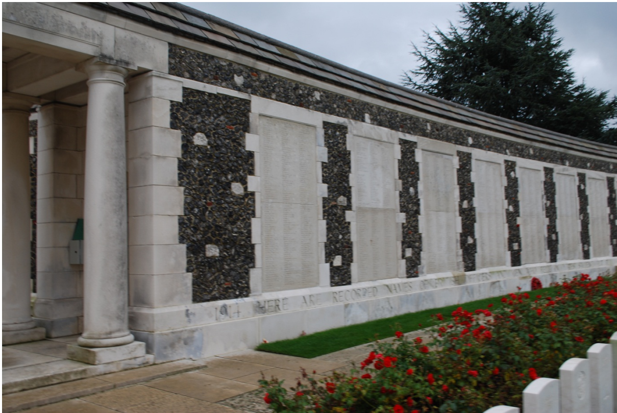
His name is inscribed right at the top of this panel.